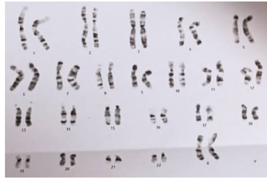
Figure 1. The karyotype analysis, the comparison of chromosome measurements, from peripheral blood samples showed chromosome XX. No Y chromosomes were recognizable.

In addition, due to the close development of the urogenital and renal systems from the hindgut, these malformations mostly occur together. Several studies have demonstrated that renal and urogenital anomalies are common (69-93%), particularly when anorectal malformations, urogenital defects or lower vertebral defects are present (13). These results are consistent with our case report. In our case study, there was a predisposition to